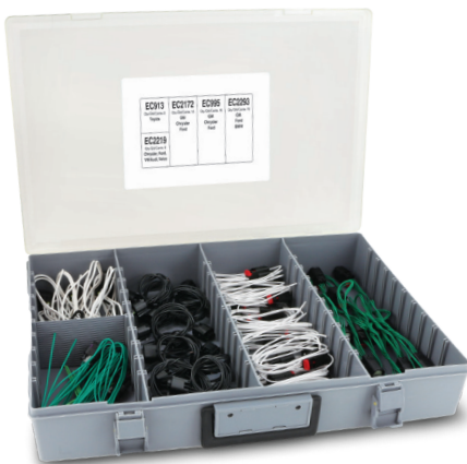
Park Assist Sensor Connector Kit