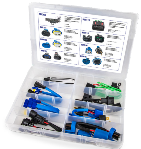
High-Temperature Connector Kit