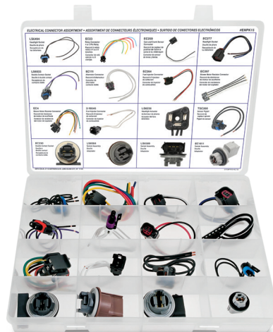
Electrical Connector Kit